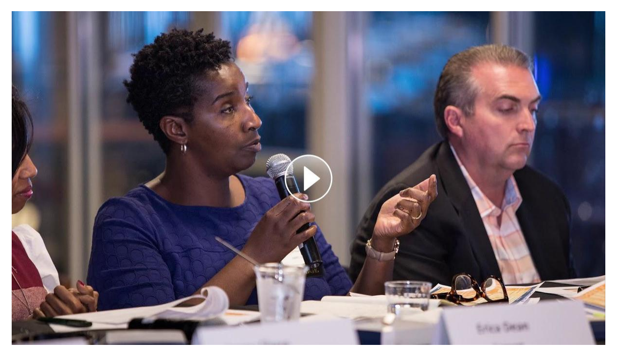
Watch two-minute video recap of 2017 ELS Case Competition