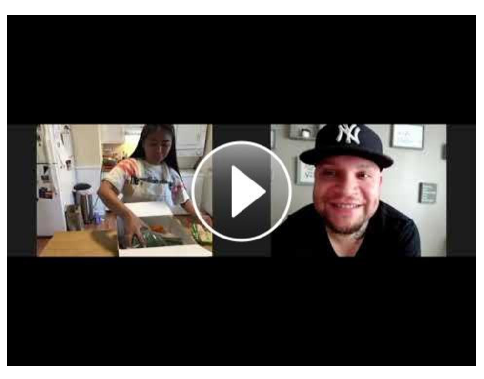
Watch two-minute video recap of 2020 Virtual Cooking Challenge

Last year, ELS responded to COVID-19 by launching the 1st ELS Virtual Cooking Challenge to provide emergency assistance to local families and children most affected by the pandemic. This year, funds will support long-term recovery efforts.