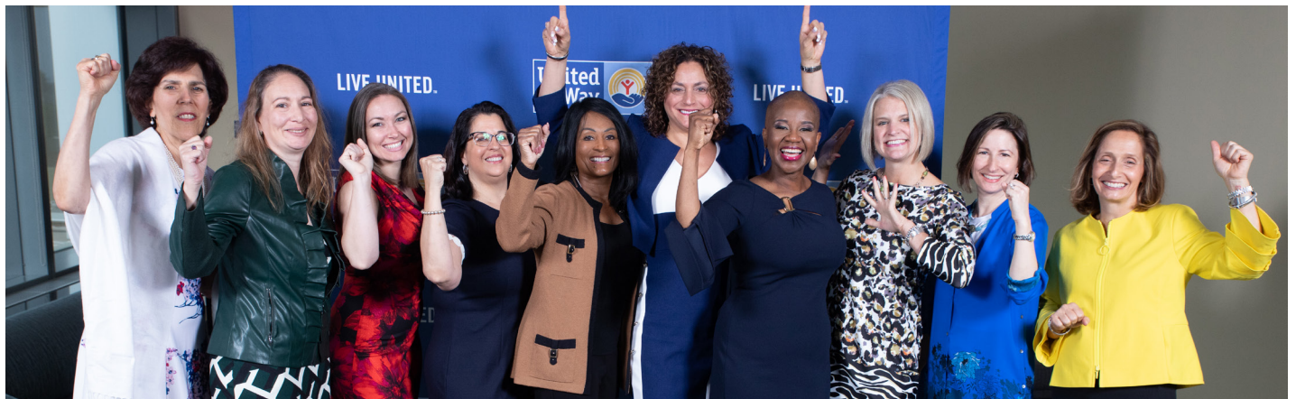
Women United members from the 2019 Power of the Purse event